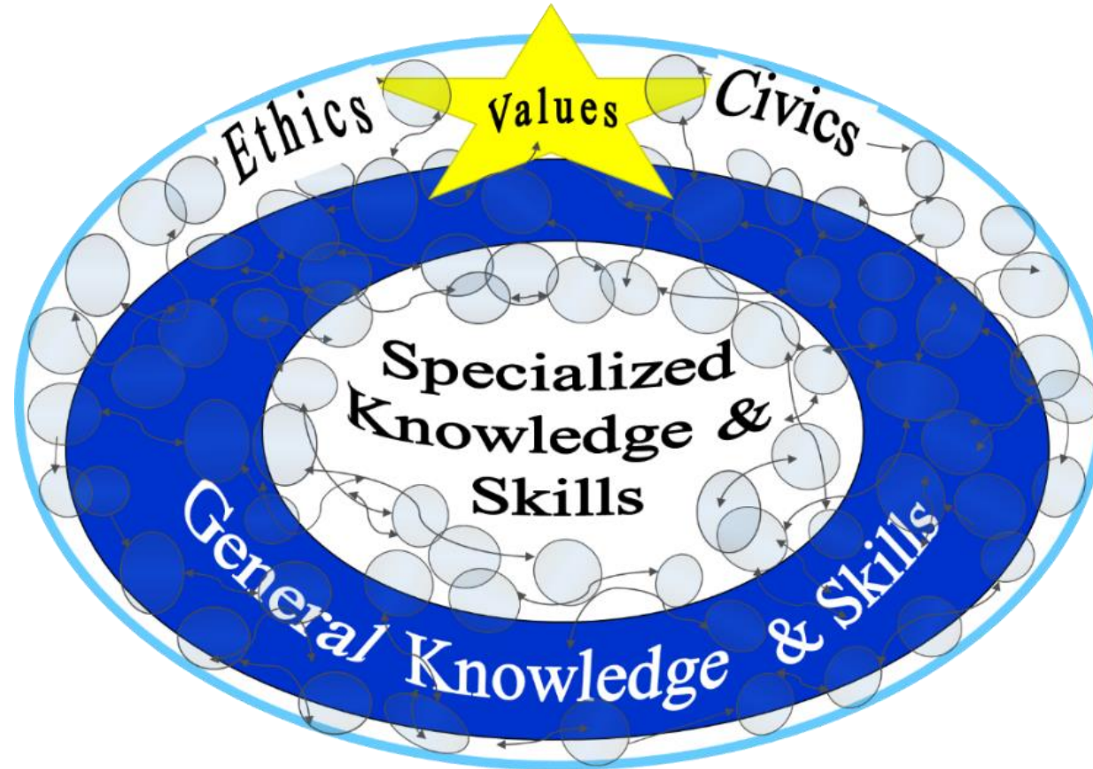
Figure 10.1, MCE Neural Structured Curriculum: Cohesive, Balanced, and Focused