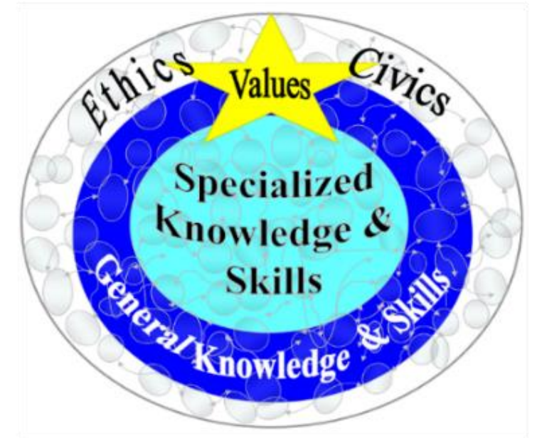
Figure 10.2. A Neural Structured Curriculum: Cohesive, Balanced, and Focused

Figure 10.3 Transition to MCCE Neural Structured Curriculum